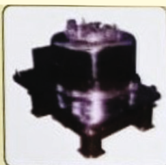
48" Ø FOUR POINT GMP CENTRIFUGE