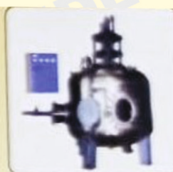
AGITATED NUTSCHE FILTER