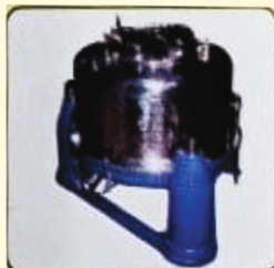
3PT STD MANUAL TOP DISCHARGE TYPE CENTRIFUGE