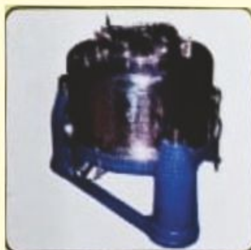
3PT STD MANUAL TOP DISCHARGE TYPE CENTRIFUGE