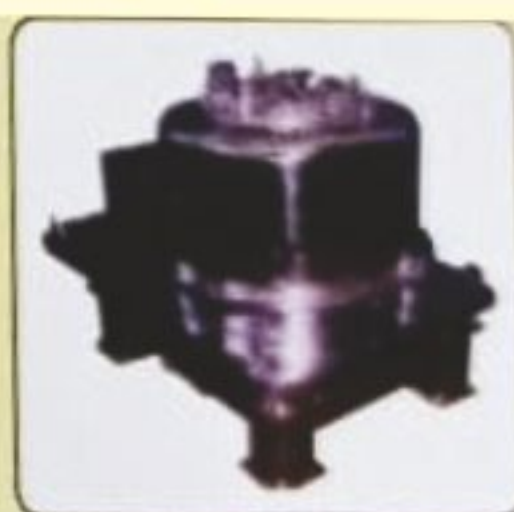
48" Ø FOUR POINT GMP CENTRIFUGE