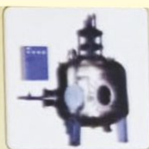
AGITATED NUTSCHE FILTER