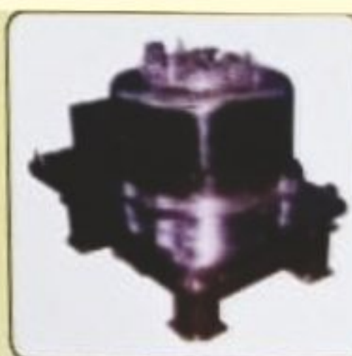
48" 0 FOUR POINT GMP CENTRIFUGE