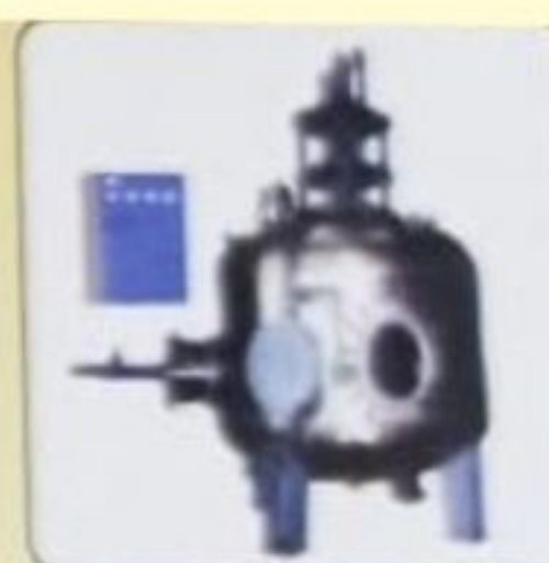
AGITATED NUTSCHE FILTER